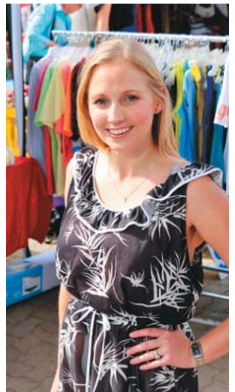
Written by KYLIE FLEMING

The great vibe is enhanced with a DJ playing music and a range of coffee and food stalls.